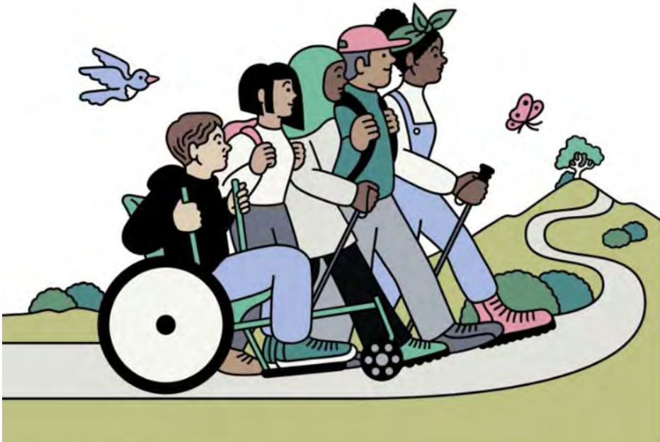
(Tomi Um / For The Times)

People of color, families with children, and lower income communities are most likely to be deprived of the benefits of nature