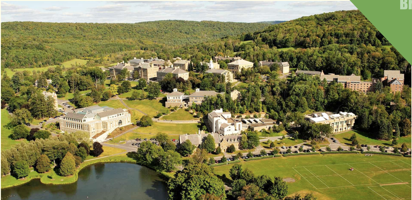
An aerial view of Colgate University.