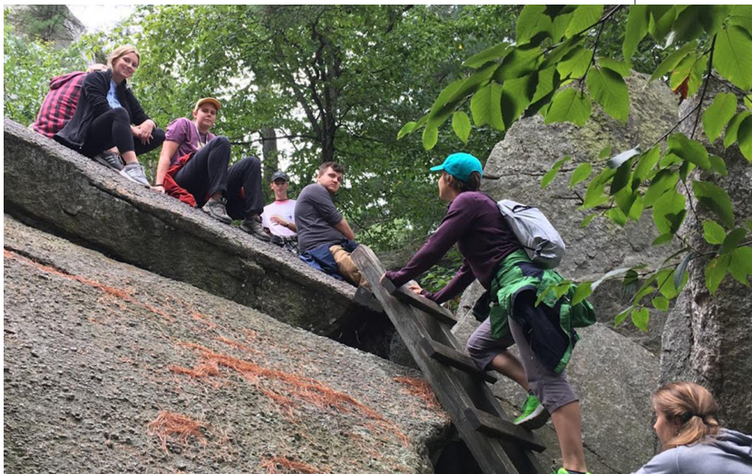
Colgate students hiking in the Colgate Forest.

This approach to land classification and use demonstrates how university properties can satisfy multiple functions at the same time, without forfeiting the overarching principle of sustainability.