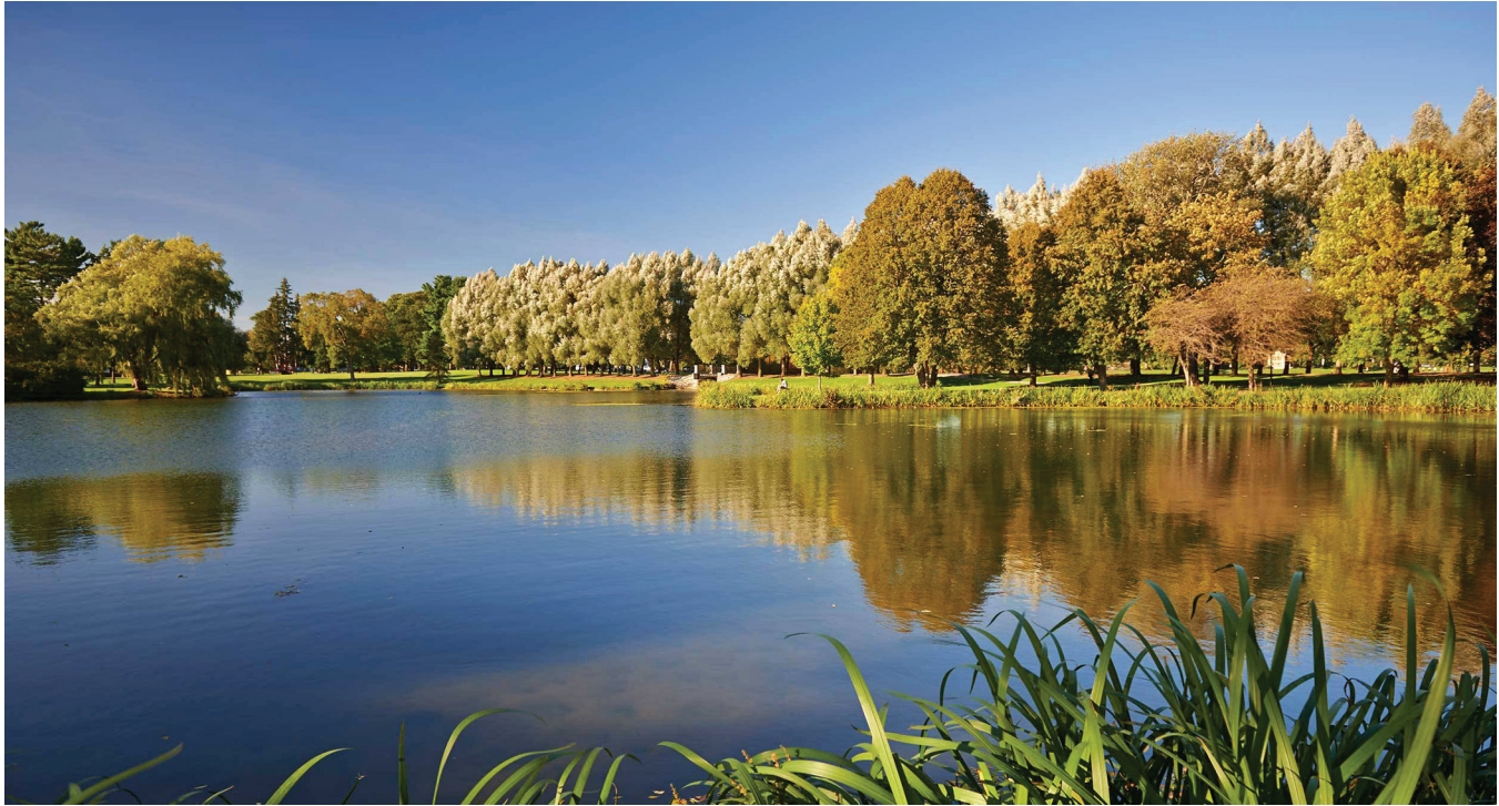
Taylor Lake.

years. 3 Estimated annual forest sequestration showcases the contribution of Colgate Forest towards the overall carbon neutrality of the College.