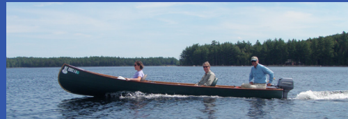
Grand Laker Canoe /Downeast Lakes Land Trust